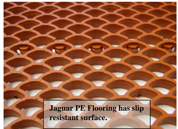
Jaguar PE Flooring has slip resistant surface.

Jaguar PE Flooring has slip resistant surface pattern and it offers maximum drainage. Open grid construction allows water to pass through the tile, providing safe and dry surface.