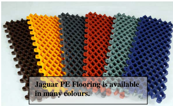
Jaguar PE Flooring is available in many colours.

Jaguar PE Flooring is durable modular tile, which can be assembled in a variety of designs and shapes. It has open construction, very good drainage capability and non-slip and safe surface. It can be installed on concrete, asphalt or any other hard and flat surface.