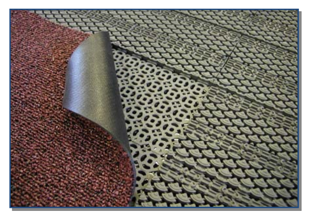
The Combo 16mm entrance mat interlocking tile is fully compatible with the Combo 9 mm - a simple and cost effective matwell solution.

Combo Matwell system is an exciting new concept that allows you create a recessed matwell without the complication or cost of having to cut a matwell into the floor. It is ideal for existing buildings without a dedicated matwell.