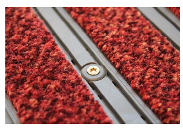
Mat is easy to roll up for the cleaning, because anchor is not fastened to the mat.