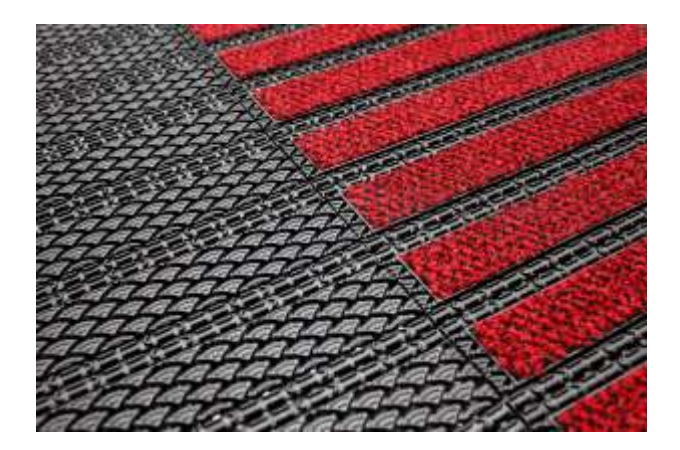
Combo 11 mm tile is fully compatible with the Integra 11 carpet tile and together they provide effective and elegant entrance areas.

Integra 11 mm entrance mat is easy to clean with the standard commercial vacuuming. Daily soiling can be dealt with using a suction vacuum cleaner or rotating brush head vacuum to remove particles from the surface of the mat. The open construction allows dirt and moisture to fall through the mat into the matwell below. This can then be removed by rolling up the mat and cleaning out the matwell