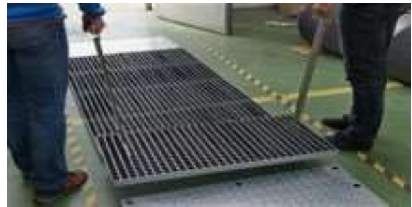
Carrying handles (accessory)