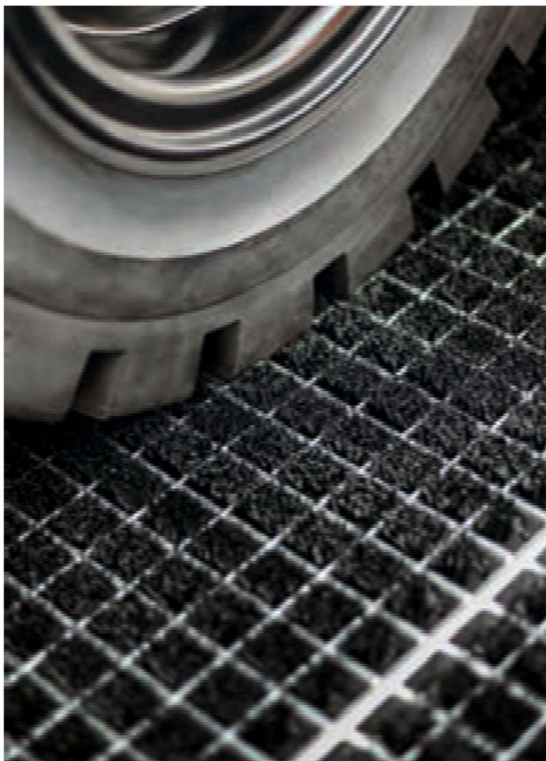
Clean wheels reduce the risk of accidents on slippery and dirty floor

They effectively create a cleaning barrier between clean and dirty zones in industry and agriculture.