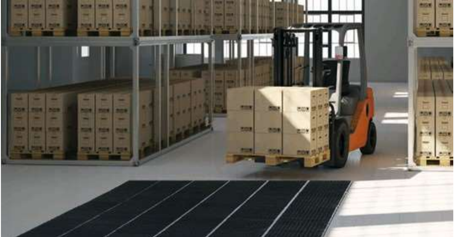
Example of cleaning area installation using MH 43 Hercules brush / steel grates