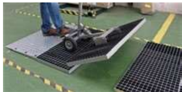
Transport trolley (optional)