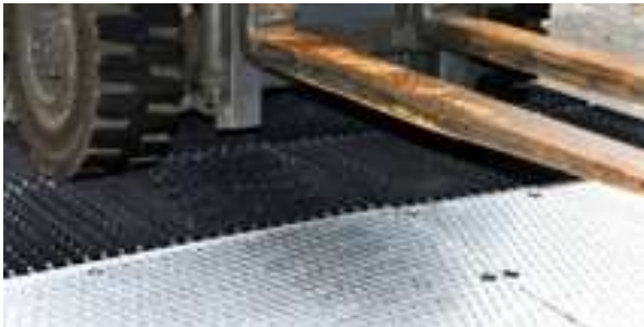
Forklifts, trucks, suitable for all vehicles