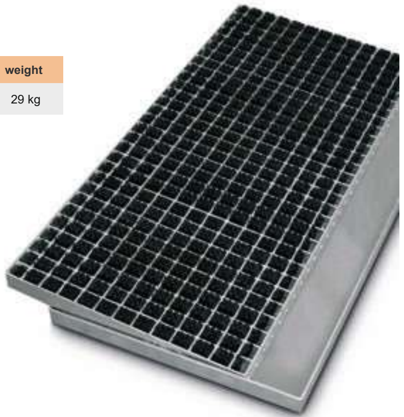
MH 43 Hercules -module and installation tray