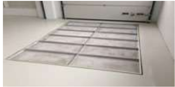
Example of MH 43 Hercules recess fabrication